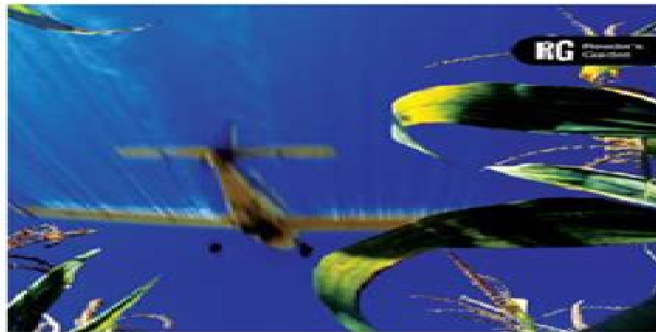
Carson's Silent Spring