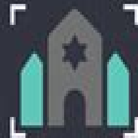
7. FEATURE MATCHING