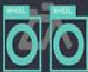
5. PATTERN DETECTION