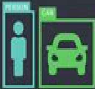
1. IMAGE SEGMENTATION