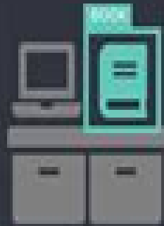
2. OBJECT DETECTION