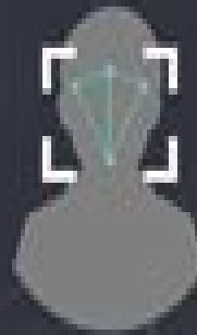
3. FACIAL RECOGNITION