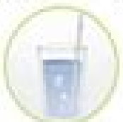
Cup of water with straw