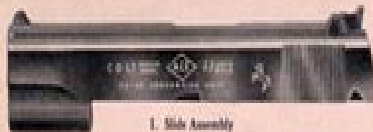
1. Slide Assembly