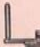
8. Slide Stop