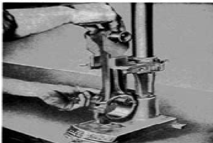
Figure 38 — Checking connecting rod for twist and alignment

2. The piston pin hole in the connecting rod must be parallel to and in plane with, the large bore in the bearing end of the connecting rod.