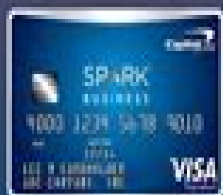
SPARK MILES FOR BUSINESS