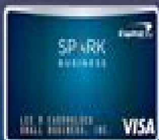
SPARK MILES SELECT FOR BUSINESS