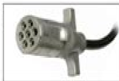
Figure 4 Lighting Connector

Test the lights and signaling prior to highway movement.