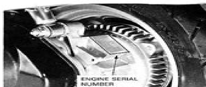
ENGINE SERIAL NUMBER

The VIN (Vehicle Identification Number) is attached to the left side of the leg shield.