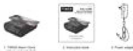
1. Product box (folded and sealed)

The product ships with the following items. Make sure all are present.