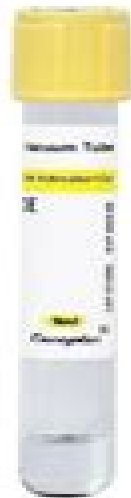
vacuum blood collection tube