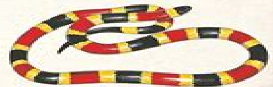
Eastern coral snake