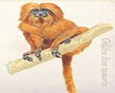
Golden lion tamarin