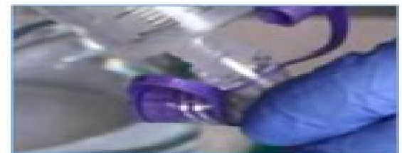
Connect syringe to the tube, being careful not to over-tighten