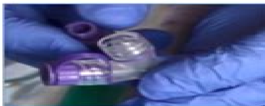
Remove cap from the feeding tube

If no clamp is present kink the tube between your fingers to stop leakage