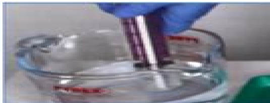
Draw up required volume of water in a 60ml enteral feeding syringe