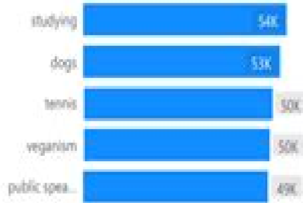
Bottom 5 Category by Aggregate Popularity Score