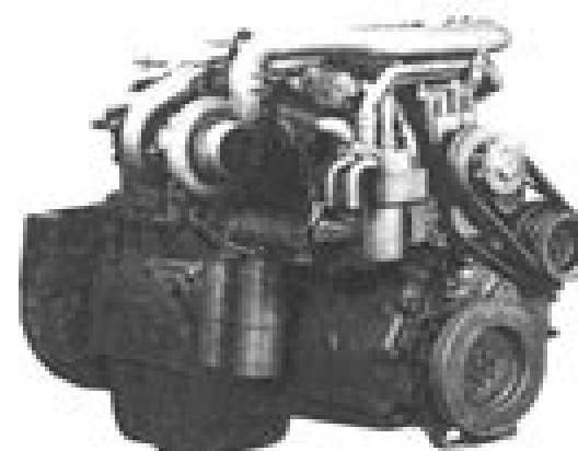
Big Cam IV