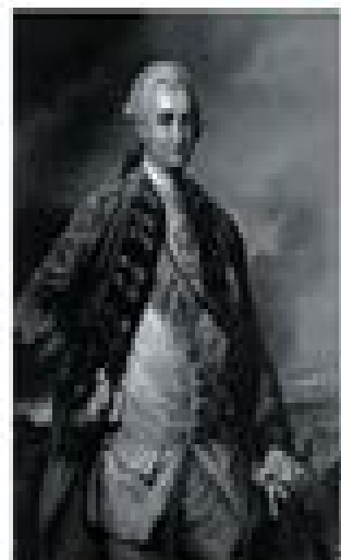
Fig. 4 - Robert Clive

After his return to England in 1707, many zamindars began to