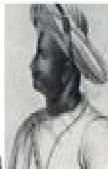
Fig. 5 - Tipu Sultan

After his return to England in 1707, many zamindars began to