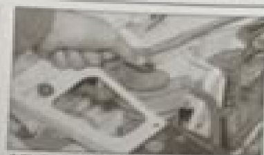
9.2c Purflux fuel filter and priming pump - up to February 1982

warning at the start of this Section. Close the engine on the starter motor until fuel emerges from the unions, then stop cranking the engine and tighten the unions. Mop up any spill fuel.