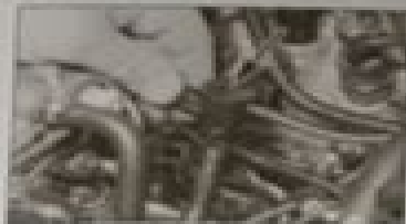
9.2d Automatic bleed valve - February 1982 onwards

1 Run the engine to normal operating temperature.