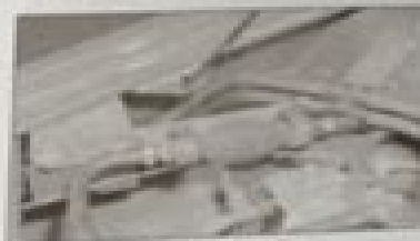
9.2b Priming bulb - February 1982 onwards

8 If the engine still fails to start after thoroughly priming the low-pressure circuit, it is likely that air has entered the high-pressure circuit downstream of the fuel pump. To bleed the injector pipes, place a rag of rag around the pipe unions at the injectors, to absorb any fuel, then loosen the unions. Refer to the