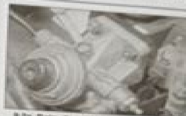
9.2a Roto-diesel fuel filter and priming pump - up to February 1982 (the bulb is for removing the filter element)

Earlier models have a bleed screw on the priming pump, so that air can be expelled from the pump and surrounding pipework before priming. Open the bleed screw and