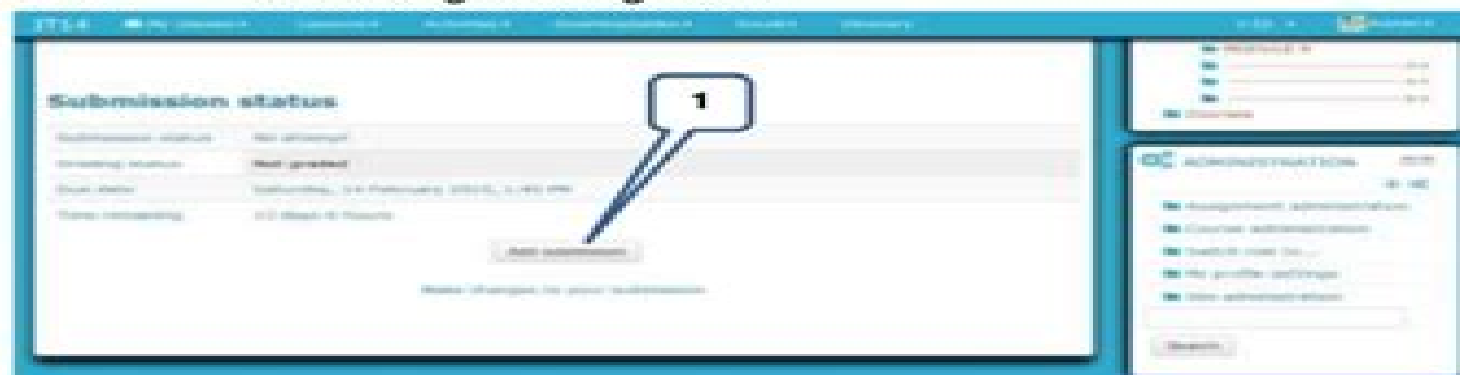
Figure 24. Adding an Assignment