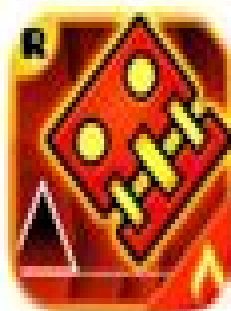
Geometry Dash Meltdown