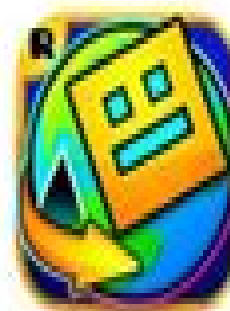
Geometry Dash World