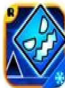
Geometry Dash SubZero