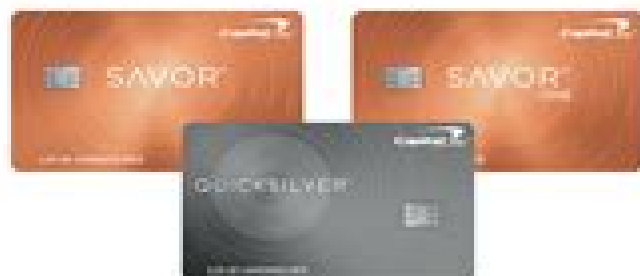
Savor, SavorOne, SavorOne Student & Quicksilver Student