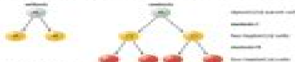
Figure 6.1: Meiosis, a two-stage cell division, results in four daughter cells with the same number of chromosomes as the parent cell. The resulting cells are haploid, containing half the number of chromosomes as the parent cell.

Meiosis: Meiosis is a two-stage cell division in which the resulting daughter cells have half the number of chromosomes as the parent cell. In every somatic cell, there are two copies of each chromosome, each from a parent. Homologous chromosomes are matching pairs of chromosomes, similar in size and carrying information for the same genes.