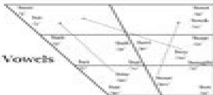
Figure 3 Variables