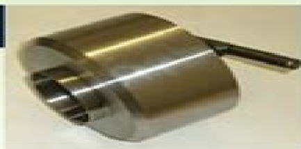
Standard Sockets & Plug