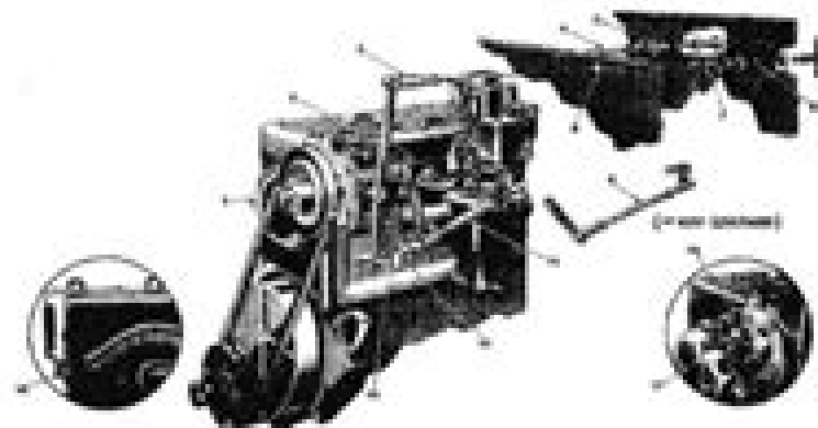
FIG. 34—GOVERNOR INSTALLATION AND ADJUSTMENT

In the absence of electrical tachometer equipment, engine speed may be determined by the speedometer. Safely jack up the rear wheels and be sure the front wheel drive is not engaged. When driving the rear wheels in high or direct transmission gear, the speedometer will read from 13½ to 15 miles per hour (22 to 24 Km./h.) at an engine speed of from 900 to 1000 rpm.