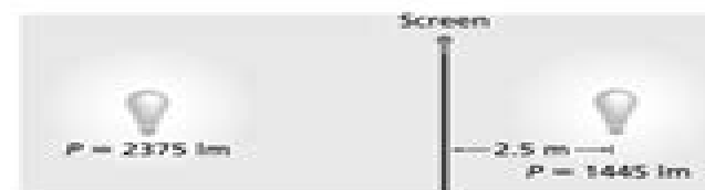
■ Figure 16-7 (Not to scale)