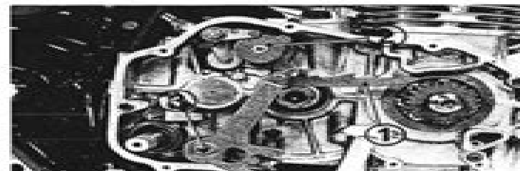
Fig. 4-63 (1) Gearshift arm (2) Gearshift drum (3) Gearshift spindle