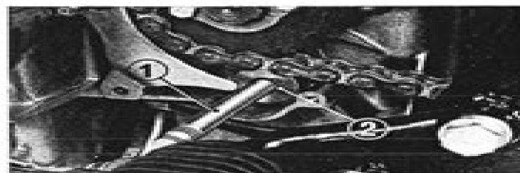
Fig. 4-62 (1) Gear shift spindle (2) Snap ring