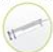
Clean piston syringe