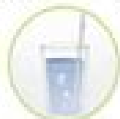
Cup of water with straw