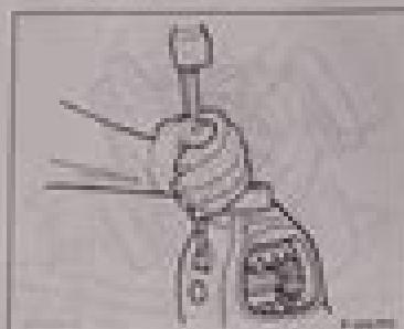
Figure 18—Installing the Lock Pin