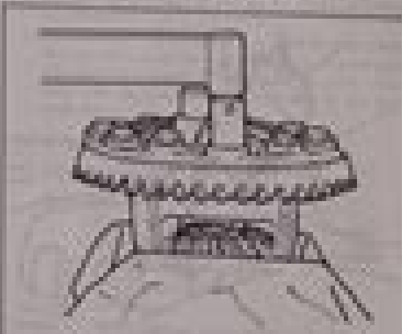
Figure 19—Installing the Ring Gear Bolt