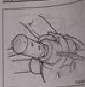
Figure 10—Assembling the Pinion