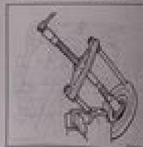
Figure 12—Assembling the Pinion and Ring Gear