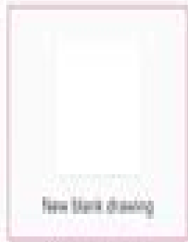
New Blank drawing

New drawing saved to OneDrive Hide templates