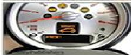
Step-by-step instructions for resetting CBS service items, 620 Maintenance