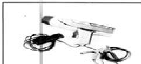
Fig. 11 Inductive type timing light