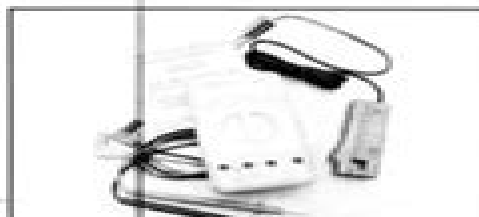
Fig. 14 Most modern automotive multi-meters incorporate many helpful features.