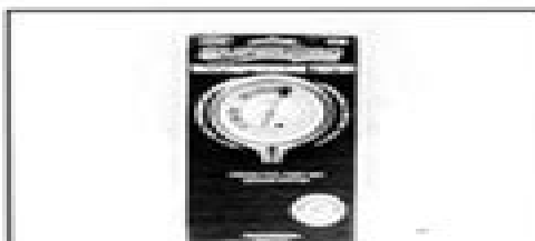
Fig. 13 A vacuum/pressure tester is necessary for many testing procedures.