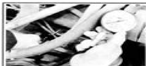
Fig. 12 A screw-in type compression gauge is recommended for compression testing.