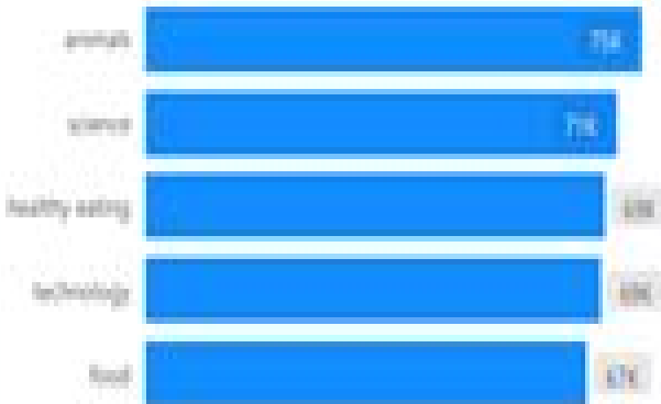
Bottom 5 Category by Aggregate Popularity Score