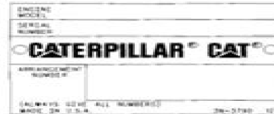
Illustration 22 Serial Number Plate

The following information is stamped on the Serial Number Plate: engine serial number, model, and arrangement number.