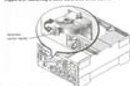
Figure 2-1. Installing a RAID Hard Drive (see Figure 2-1)