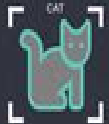
4. EDGE DETECTION