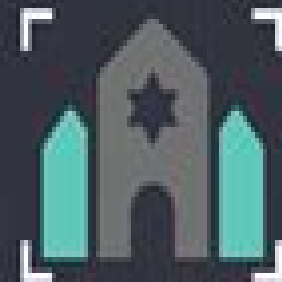
7. FEATURE MATCHING