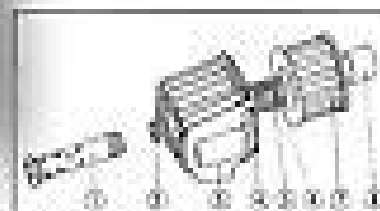
Fig. 5-29 Oil pump assembly