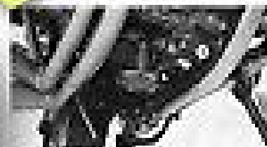
Fig. 5-28 Oil screen filter