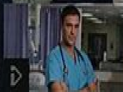
Doctors Episode 10