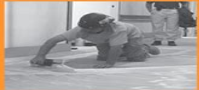
KNEELING TO WORK NEAR FLOOR