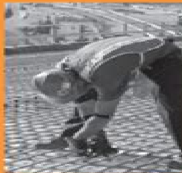
TYING REBAR BY HAND