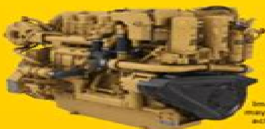
Image shown may not reflect actual engine