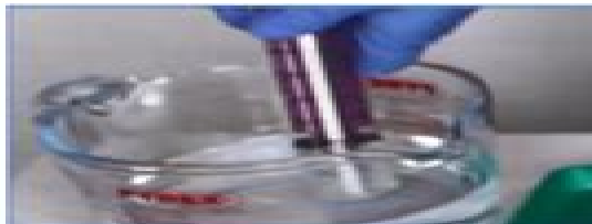
Draw up required volume of water in a 60ml enteral feeding syringe