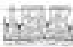
Simple Cuboidal Epithelium