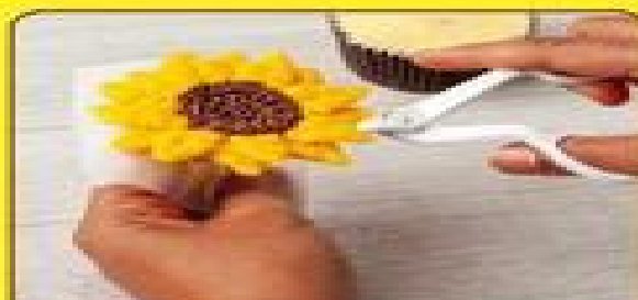
SIMPLY STUNNING FLORAL IDEAS