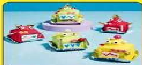
CUTE FONDANT PARTY TREATS