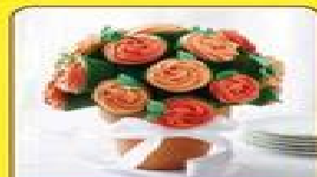
CUPCAKES TO WOW!