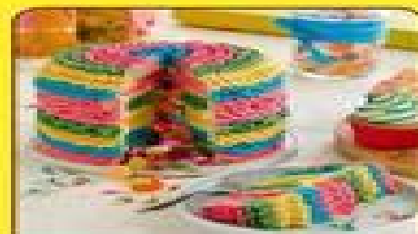
QUICK CELEBRATION CAKES