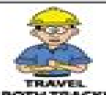
TRAVEL BOTH TRACKS

Voice signals of crane must contain 3 elements, given in the following order: 1) Function (such as hoist, boom, etc.) 2) Direction, distance and/or speed 3) Function, stop command example: "hoist, slow, slow, slow, hoist STOP"