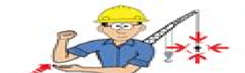
USE AUXILIARY HOIST (use the whipline)