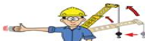
RAISE THE BOOM AND LOWER THE LOAD