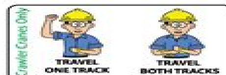
TRAVEL ONE TRACK