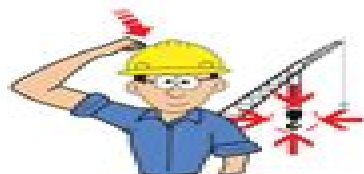
USE MAIN HOIST