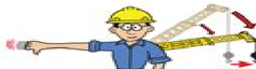
LOWER THE BOOM AND RAISE THE LOAD