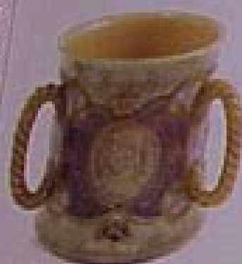
A Royal Doulton glazed stoneware mug commemorating the life of Lord Nelson, with three tape-effect handles, c1900, 85mm (3 3/8in) high.