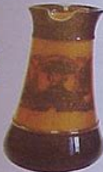
A Royal Doulton salt-glazed jug commemorating the life of Lord Nelson, with a lion and crown, c1900, 105mm (4 1/8in) high.