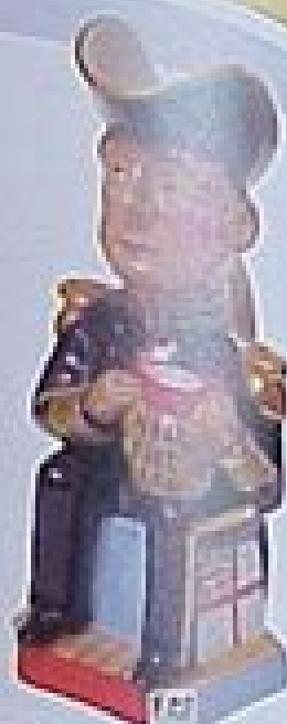
A Wilkinson Toby Jug, designed by Sir Francis Carruthers Gould, in the form of Admiral John Jellicoe, mounted 'The Peacock', 1920, 105mm (4 1/8in) high.