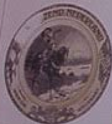
A Dutch Delft plate, commemorating the end of WWII, depicting William of Orange on November 5, 1647, in Maastricht, 1947, 100mm (4in) diam.