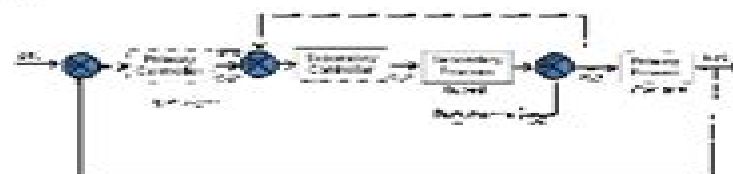
Fig. 1. Cascade control of DC motor with inner speed and outer position loop

The purpose of decoder is to decode signal from rotary encoder. The outputs of the rotary encoder are sets of pulses train. Specifically, the decoder is mixed quadrature decoder [2].