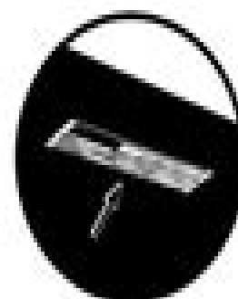
ENGINE SERIAL NUMBER

NOTE 2: All models - Bucket serial number is on the back of the spillguard.