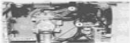
Serial Number SLK1-UP & 1KL1-UP