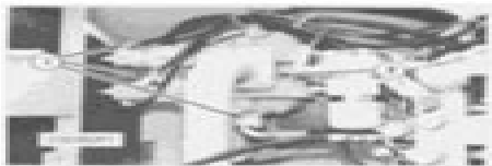
Serial Number 9KX1-UP & 2DL1-UP

7. Disconnect either six or seven hydraulic hoses (7) as necessary. Cap or plug immediately.