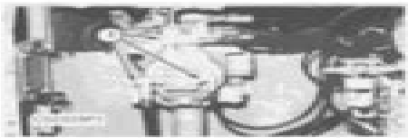
Serial Number SLK1-UP & 1KL1-UP