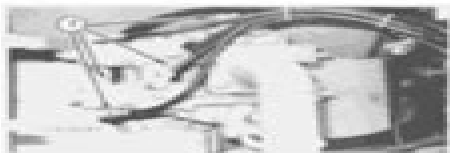
Serial Number 9KX1-UP & 2DL1-UP