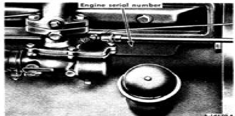
Illustr. 3B Location of engine serial number.

The engine serial number is stamped on the left side of the engine crankcase to the right of the carburetor. This serial number is preceded by the letters FCUBM . See Illustr. 3B .