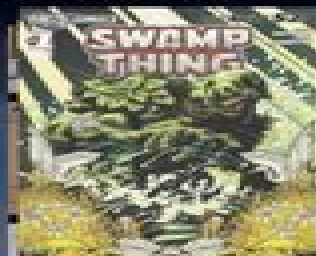
Swamp Thing (2011-) #1 Issue #1