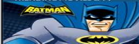
Batman: The Brave and the Bold