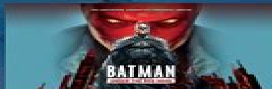
Batman: Under the Red Hood