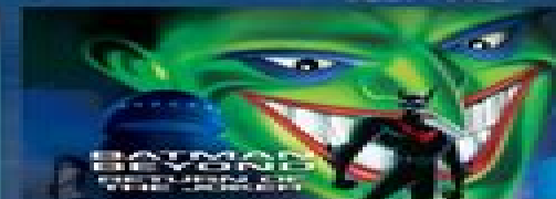
Batman Beyond: Return of the Joker