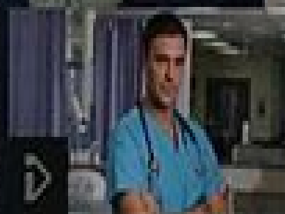
Doctors Episode 10