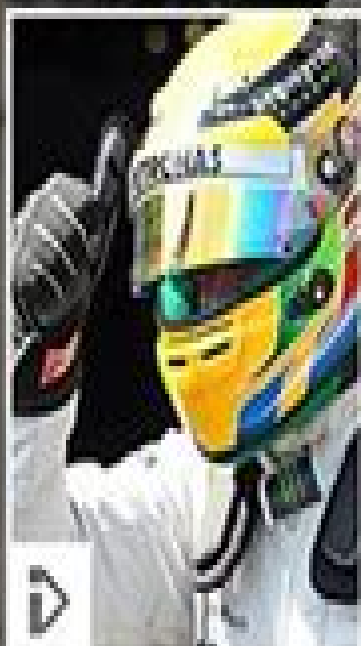
F1 Japan Live Qualifying