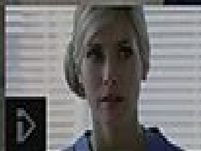
Holby City Episode 7