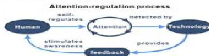
Figure 1. Technology-mediated attention-regulation process [15, 16]. Technology detects the current state of the user's attention and provides real-time feedback to support self-regulation. Our work provides a framework which shows how technology can detect human attention without the use of dedicated sensors, and what kind of feedback can effectively support attention-regulation process.

As our world becomes increasingly fast-paced, we occasionally need to disconnect and refresh ourselves. Mindfulness meditation is a helpful technique which can bring one's attention back to the present moment [19]. Mindfulness practice [47] is defined as a “family of self-regulation practices that focus on training attention in order to bring mental processes